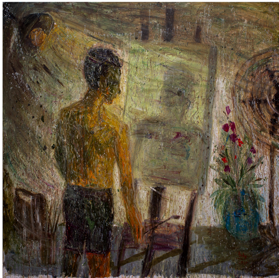
BASIC PAINTING Oil on Canvas 60 x 60 inches, 2020,