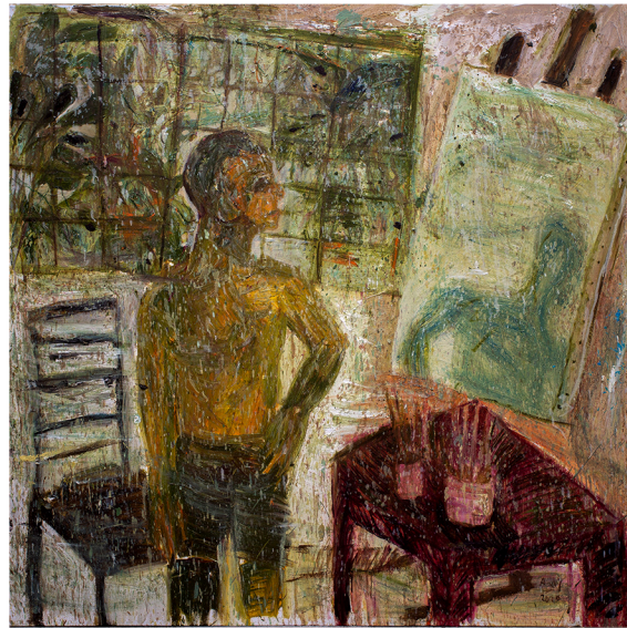
AHEAD OF TIME 2 Oil on Canvas 60 x 60 inches, 2020