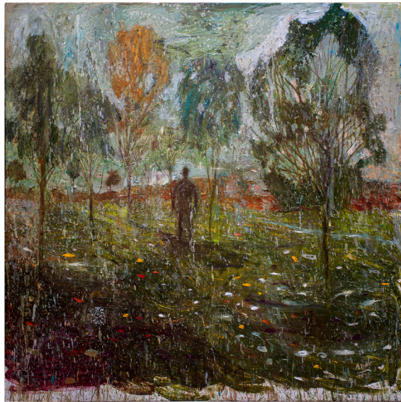
WISDOM Oil on Canvas 60 x 60 inches, 2020