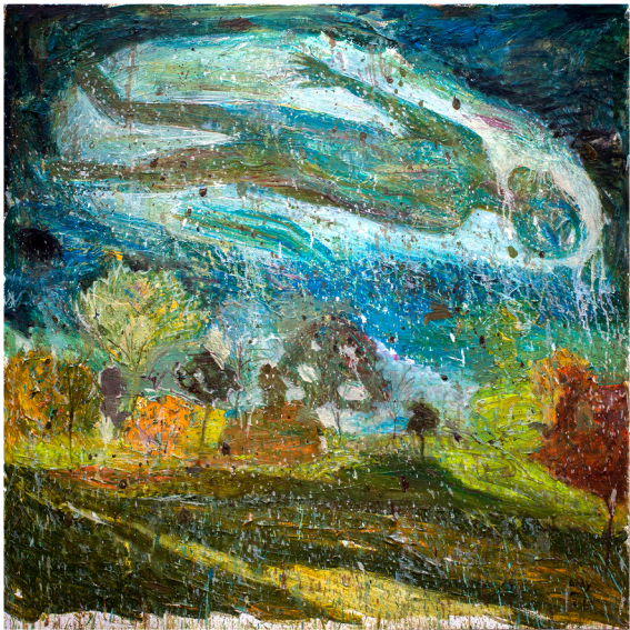
DREAMER Oil on Canvas 60 x 60 inches, 2020