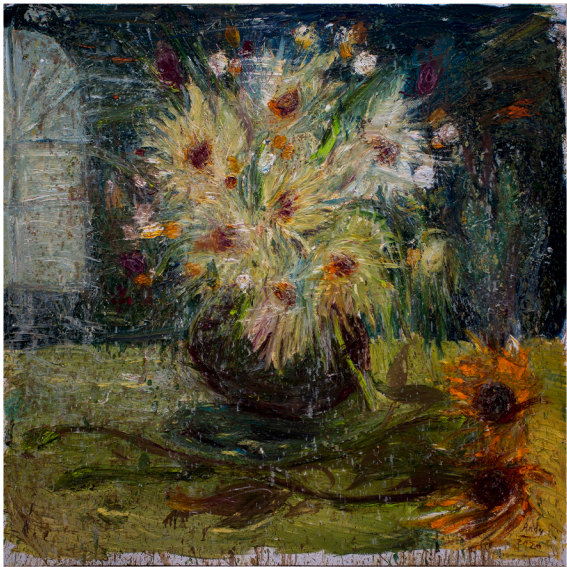
ADORATION Oil on Canvas 60 x 60 inches, 2020