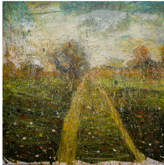
IN DUE TIME Oil on Canvas 60 x 60 inches, 2020