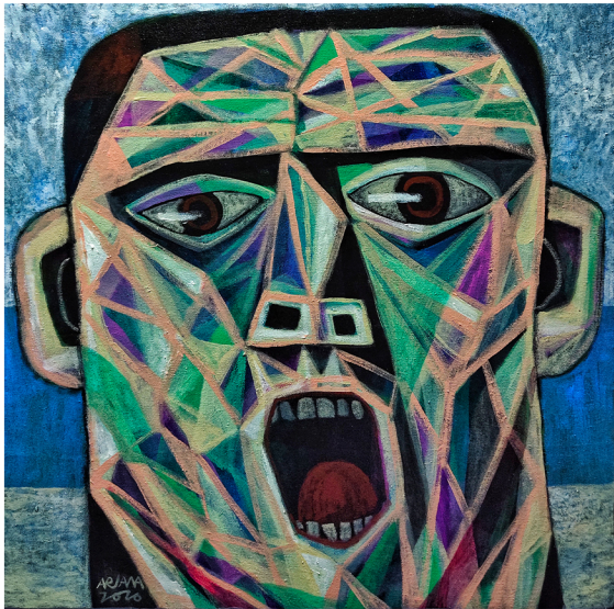
DOLO MIKE Arnel Natividad 24 x 24 inches Acrylic on Canvas 2020