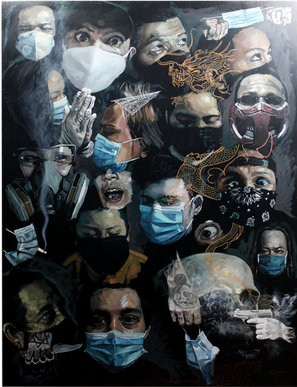
DALAW Jolo Senense 48 x 36 inches Oil on Canvas 2020