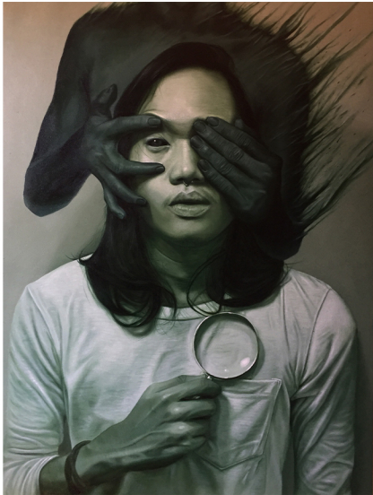
AGAM - AGAM Rhoss Gadiana 48 x 36 inches Oil on Canvas 2020