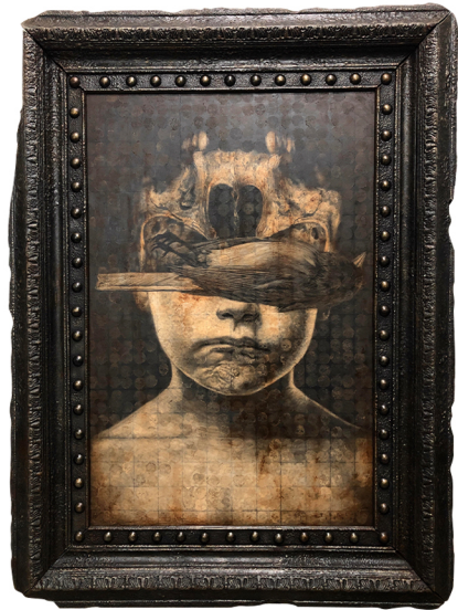
LIFE Macj Turla 48 x 36 inches Oil and Acrylic on Canvas 2020