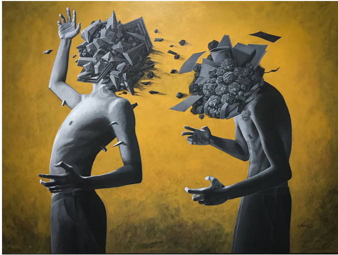
ISANG HAKBANG Ricky Natividad 38 x 48 inches Acrylic on Canvas 2020