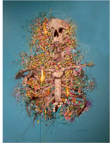
OWNED Christian Maglente 48 x 36 inches Oil and Acrylic on Canvas 2020