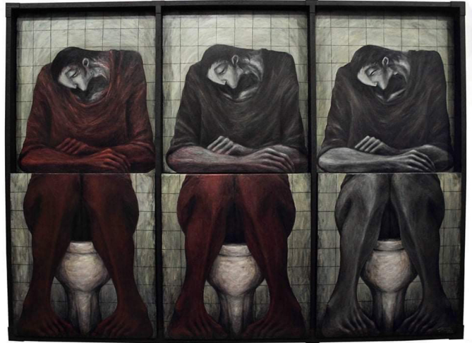
TAKE THAT SHIT OUT OF YOU Cendrick Dela Paz 36 x 48 inches Acrylic on Canvas 2020