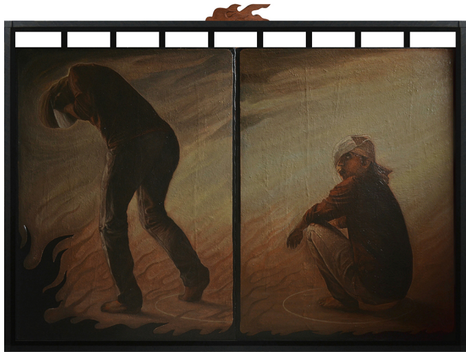
BUSABOS Mark Laza 37.4 x 28.4 inches Oil on Canvas, Wood and Resin 2020