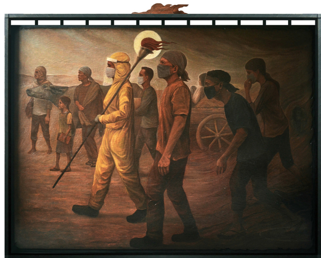
POST Mark Laza 48.4 x 40.6 inches Oil on PVC Board and Wood 2020