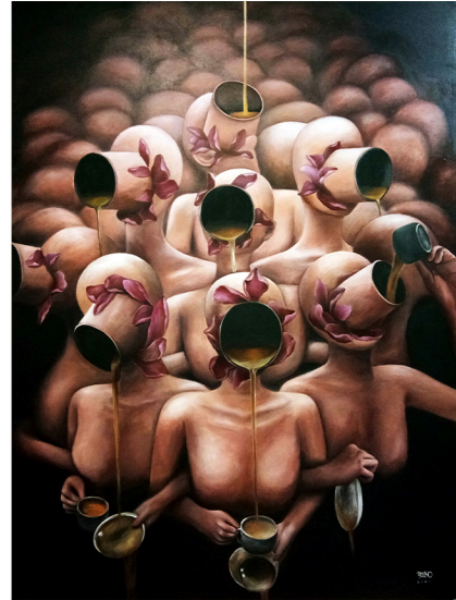
KINSENAS, KATAPUSAN Revelie Bueno 48 x 36 inches Acrylic on Canvas 2020