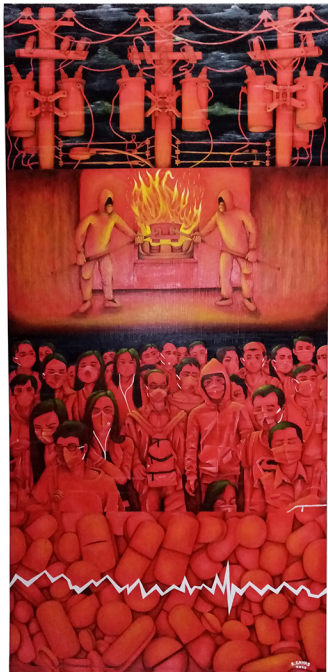
PAUSE Ron Cayas 48 x 24 inches Acrylic on Canvas