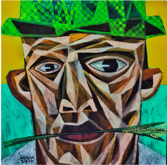
UNCLE WRINKLE Arnel Natividad 24 x 24 inches Acrylic on Canvas 2020