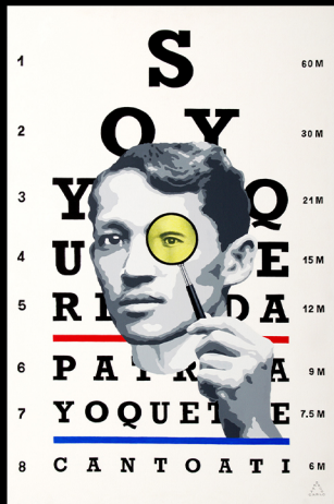
Rizal Eyechart Series - Small Eye 36 x 24 inches, Acrylic on Canvas 2020