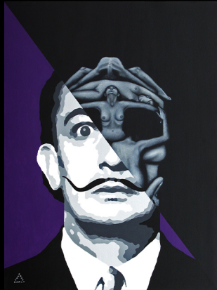
Dali - Nude - Diagonal in Purple 40 x 30 inches, Acrylic on canvas 2021