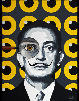
Dali - Magnifying Glass 32 x 24 inches, Acrylic on Canvas 2020