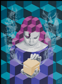
Pandora 40 x 30 inches Acrylic on Canvas 2020