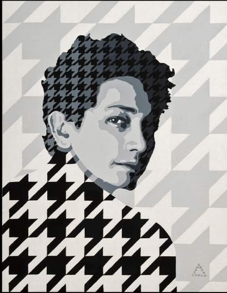
For the Love of Houndstooth Acrylic on Canvas