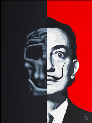
Dali - Nude - Vertical in Red 40 x30 inches, Acrylic on Canvas 2020