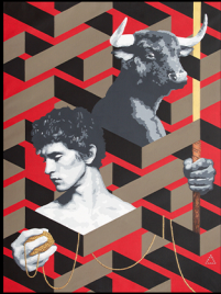
Theseus and the Minotaur 40 x 30 inches Acrylic on Canvas 2020