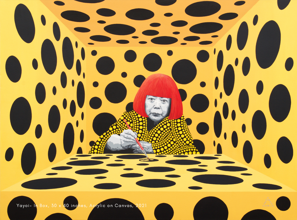
Yayoi- In Box, 30 x 40 inches, Acrylic on Canvas, 2021