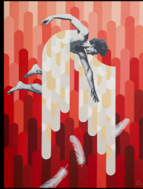
Icarus - Red 48 x 36 inches Acrylic on Canvas 2020