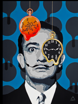
Dali - Clocks 32 x 24 inches Acrylic on Canvas 2020