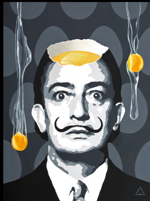
Dali - Yolks 32 x 24 inches Acrylic on Canvas 2020