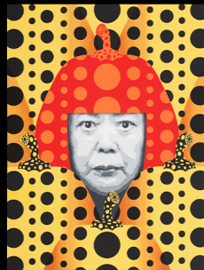
Yayoi-Pumpkin 30 x 40 inches Acrylic on Canvas 2021