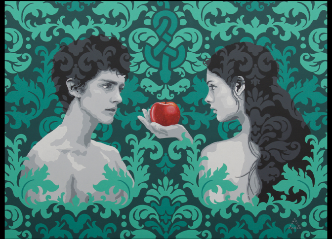
Adam and Eve Acrylic on Canvas