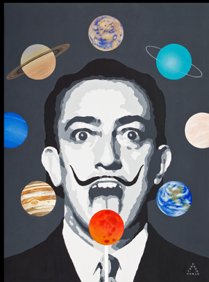
Dali-Planets 32 x 24 inches Acrylic on Canvas 2020