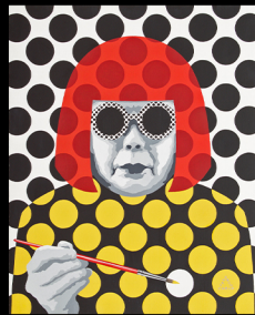
Yayoi in Shades 30 x 24 inches Acrylic on Canvas 2020