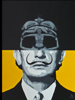
Dali - Nude - Horizontal in Yellow 40 x 30 inches, Acrylic on Canvas 2020