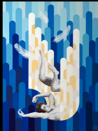
Icarus - Blue 48 x 36 inches Acrylic on Canvas 2020