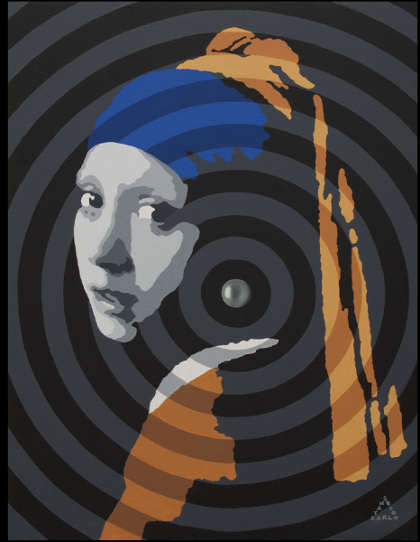
Pearl Earring with Girl Acrylic on Canvas