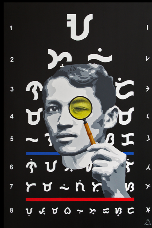
Rizal Eye Chart Series - Baybayin 36 x 24 inches, Acrylic on Canvas 2020