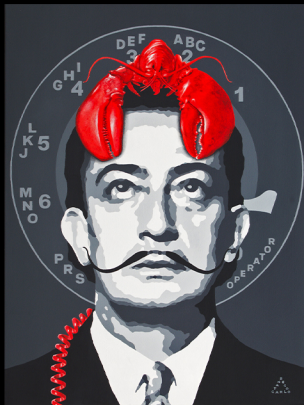
Dali - Lobster 32 x 24 inches Acrylic on Canvas 2020