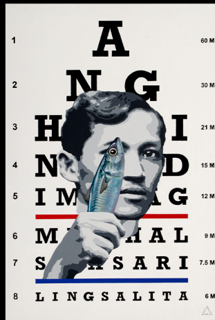
Rizal Eye Chart Series - Malansang Isda 36 x 24 inches, Acrylic on Canvas 2020