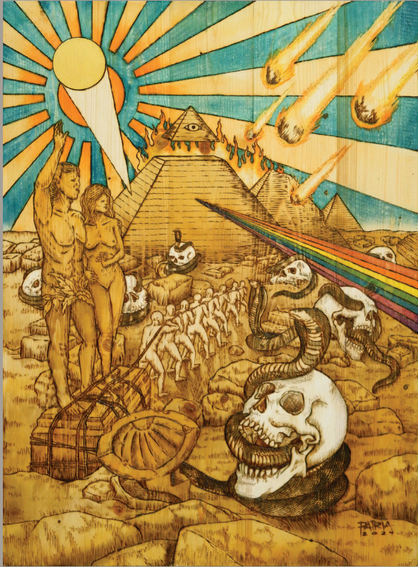
I: Even The Gods Pyrography and Ink on Pine Wood 36 x 27 Inches 2024