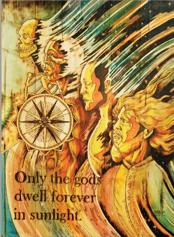
V: We Are But Wind Pyrography and Ink on Pine Wood 36 x 27 Inches 2024