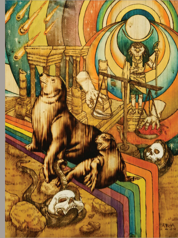
II: Basking In Moonlight Pyrography and Ink on Pine Wood 36 x 27 Inches 2024