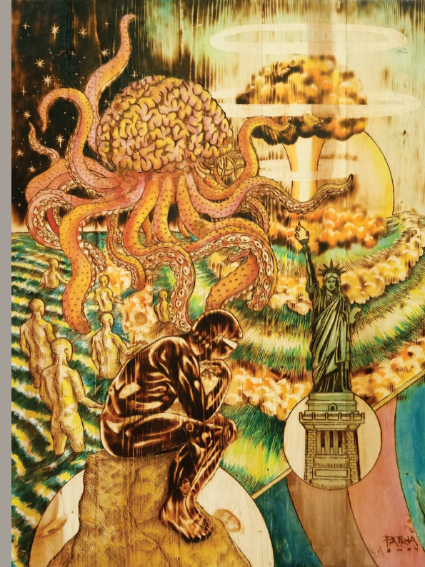
IV: For A Brighter Future Pyrography and Ink on Pine Wood 36 x 27 Inches 2024