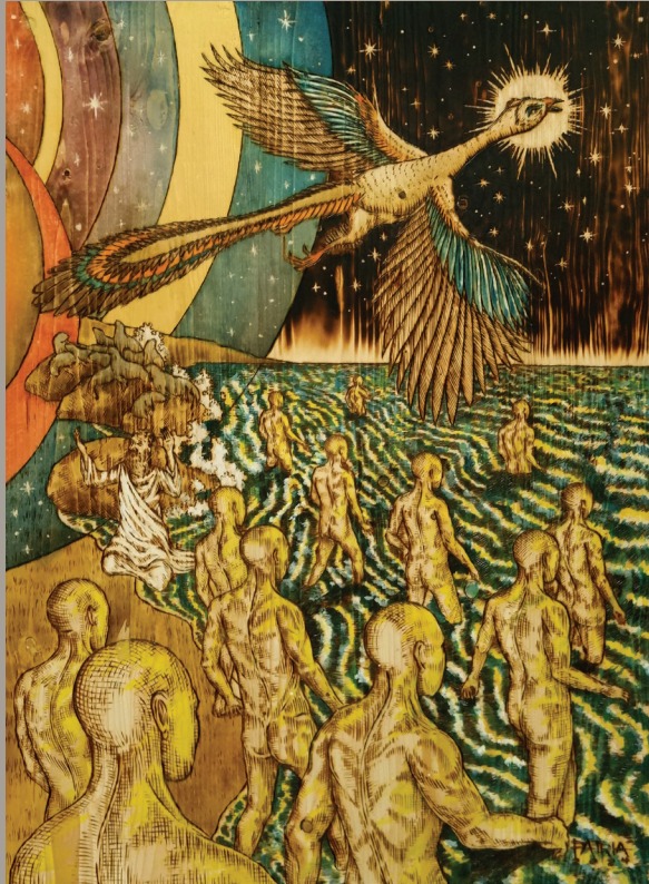
III: A Sea Of Ghosts Pyrography and Ink on Pine Wood 36 x 27 Inches 2024