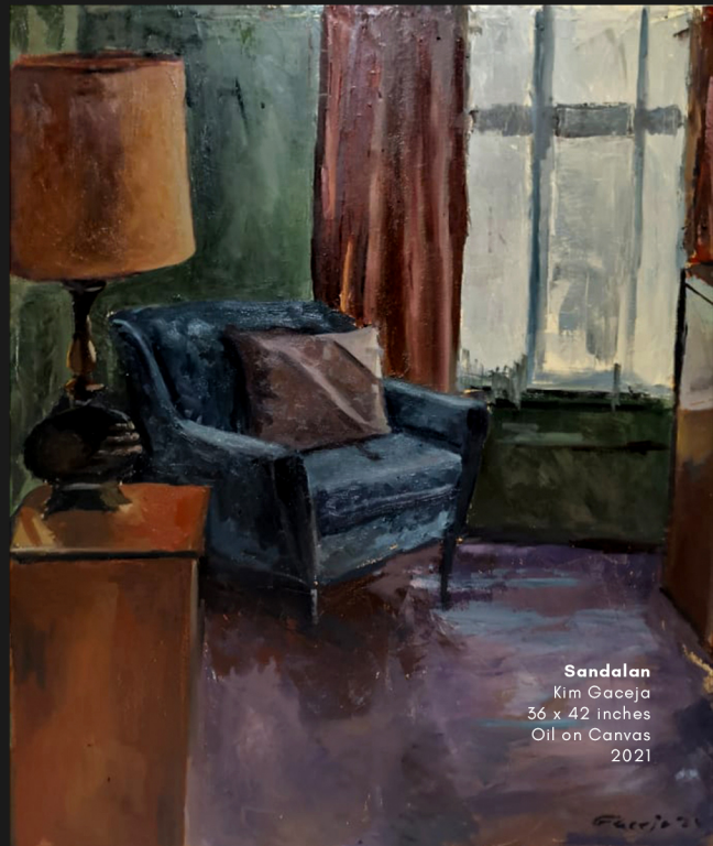
Sandalan Kim Gaceja 36 x 42 inches Oil on Canvas 2021