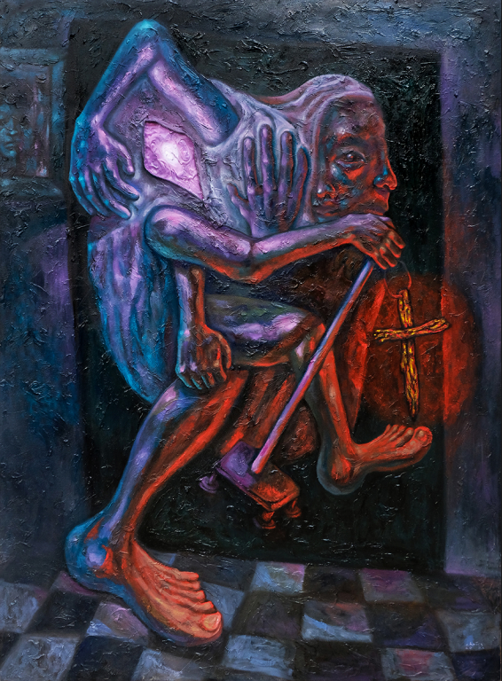
Gabay ni Lola Flor Christian Culangan 72 x 53 inches Oil and Zipper on Canvas 2021